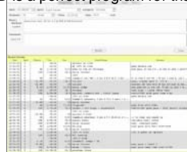
The Athlete's Diary Summary page

Cons: No manual data entry, backup is manual