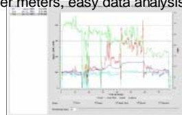
A ride summary from Golden Cheetah