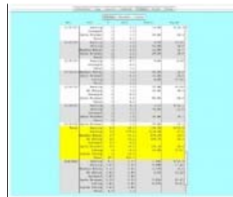
The Athlete's Diary data entry page

TAD is a stable & simple training log for manual input of data. It does not accept downloading data from any device – no power, heart rate or GPS. You simply set up the sports you do & enter the time & distance