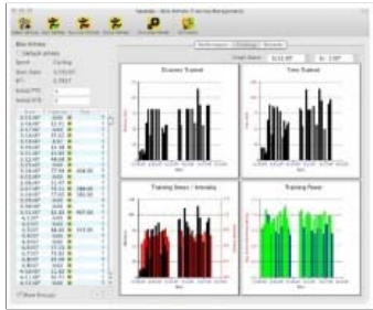
The "training" summary from RaceDay.